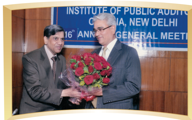
CAG of India, Shashi Kant Sharma being welcomed with a bouquet at the AGM held on 7 th January 2014

He informed that CAG of India has been awarded the responsibility for audit of the United Nations and the CAG of India has become member of UN Board of Auditors. This selection by the highest International Organisation in the World enhanced the profile of CAG of India as an Institution of eminence and he hoped that the coming year 2014 would bring new cheers and happiness for the Service.