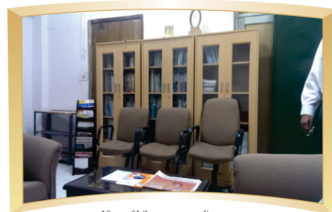
View of Library cum reading room

The Institute office was renovated and new facilities like a Reading Room were developed and new computers and accounting software were acquired for speedier compilation of the Annual Financial Statements of the Institute and its audit in time bound manner. The Website of the Institute was revamped with several new and user-friendly features and a new agency was engaged for maintaining the website.