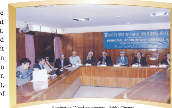
Seminar on "Good governance - Public Finance and Public Accountability" held on 14 th October 2013 in progress