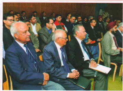
A Section of Veterans at the Seminar

The CAG (DPC) Act was passed in 1971 and since then many developments have taken place. The Act needs to be replaced with a comprehensive new legislation. The existing Act talks about three types of audit, namely the Expenditure Audit, Receipt Audit and Commercial Audit. Since then new types of audits have emerged like the Performance Audit, the Environment Audit and Information Technology Audits. These need to be included in the Act. The new Audit Act must also, among other things, stipulate a time period within which CAG's Audit Reports should be presented to the Parliament/State Legislatures after being submitted to the President/Governor as provided in Article 151 of the Constitution of India.