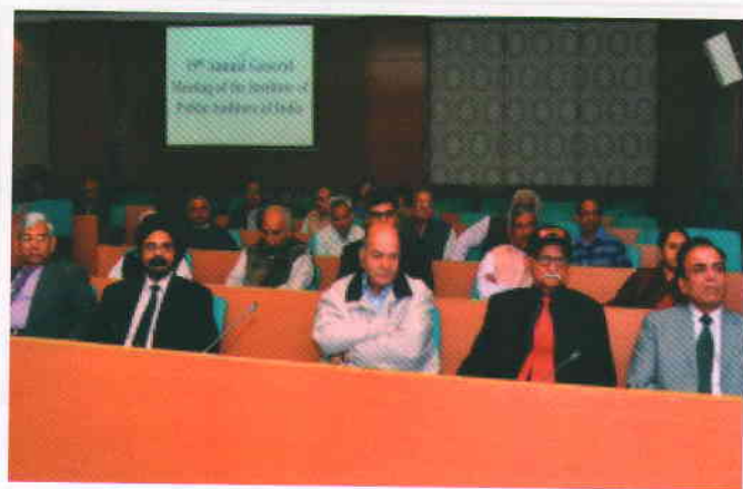
A Section of Veterans at the AGM