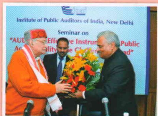
Dr. Murli Manohar Joshi being welcomed with a bouquet at the Seminar.