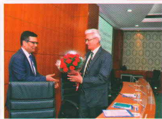
CAG of India, Shashi Kant Sharma being welcomed with a bouquet at the AGM