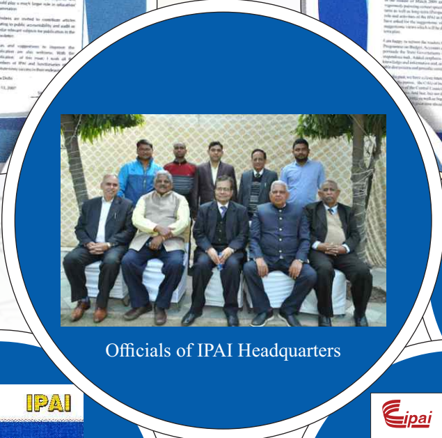
Officials of IPAI Headquarters