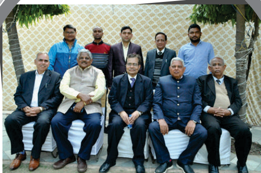
Officials of IPAI Headquarters